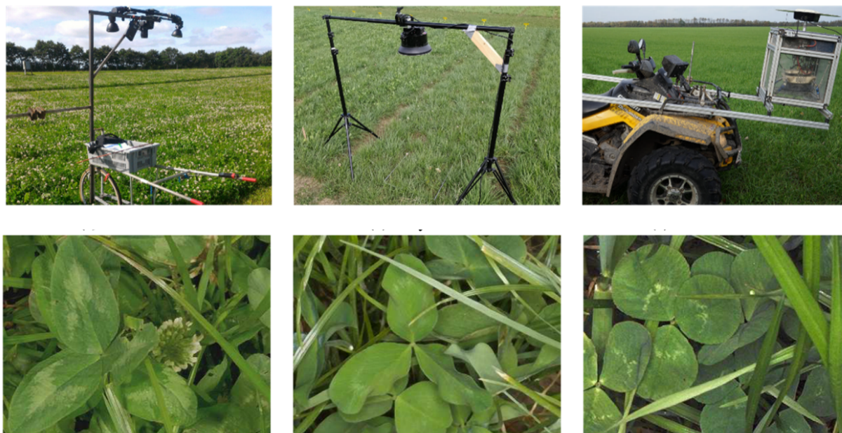
Fig. 5. Three imaging platforms (top row) and example images (bottom row) from the corresponding platforms above. Images are reproduced from (Skovsen et al., 2019) with permission.

the issue, one may construct an enclosed imaging chamber with lighting control (Giselsson et al., 2017), or acquire images at steady light conditions, e.g., during overcast days or in the night with artificial lighting (Koirala et al., 2019), at the cost of reduced working hours. An alternative solution highlights the need for collecting a large-scale set of images in the varied natural light conditions and exploiting the capacity of deep learning models to tackle the light interference. The use of integrative RGB and NIR, i.e., multispectral color-infrared (CIR) modality is becoming increasingly popular, which can potentially provide enhanced performance given the fact that NIR is less susceptible to the variations of visual appearance of plants.