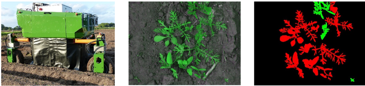
Fig. 1. Field robot for image acquisition (left), a sample of collected images (mid) and the annotation (right). Reproduced from (Haug and Ostermann, 2015) with permission.

includes a collection of characteristics, including imaging device and configurations, image number, format and resolution, annotation type, applications and possible limitations. The image format, most often in png or jpg/jpeg, and resolution, which vary with imaging device and post-processing operations, are only described when they are consistent in a specific dataset. The datasets are presented in chronological and alphabetical order.