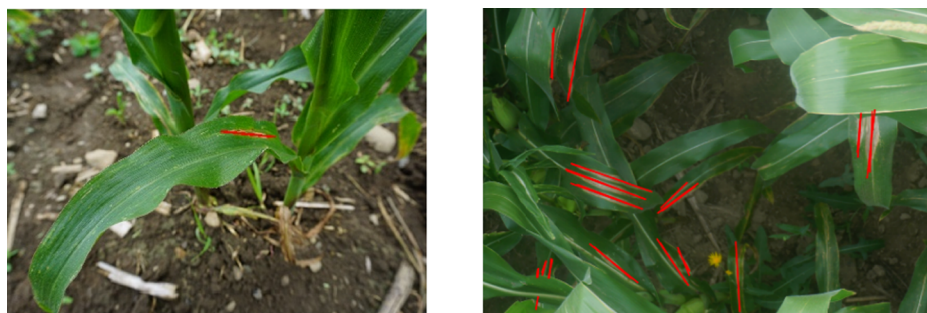
Fig. 4. Examples of images randomly chosen from the Maize Disease dataset (Wiesner-Hanks et al., 2018), where the red lines denote the position of disease lesions based on the provided line annotations. (For interpretation of the references to color in this figure legend, the reader is referred to the web version of this article.)

Among the reviewed 34 public datasets, 24 datasets involve using RGB cameras for image acquisition, confirming the prevalence of this modality. RGB is advantageous in its low cost, high image resolution and fast speed, which are all desirable for precision agriculture applications. Moreover, the acquired images can be readily fed into a wide range of existing machine learning frameworks for computer vision tasks as classification and object detection. RGB images, however, are sensitive to the light condition variations in the field, which pose challenges to the image segmentation and object detection. To alleviate